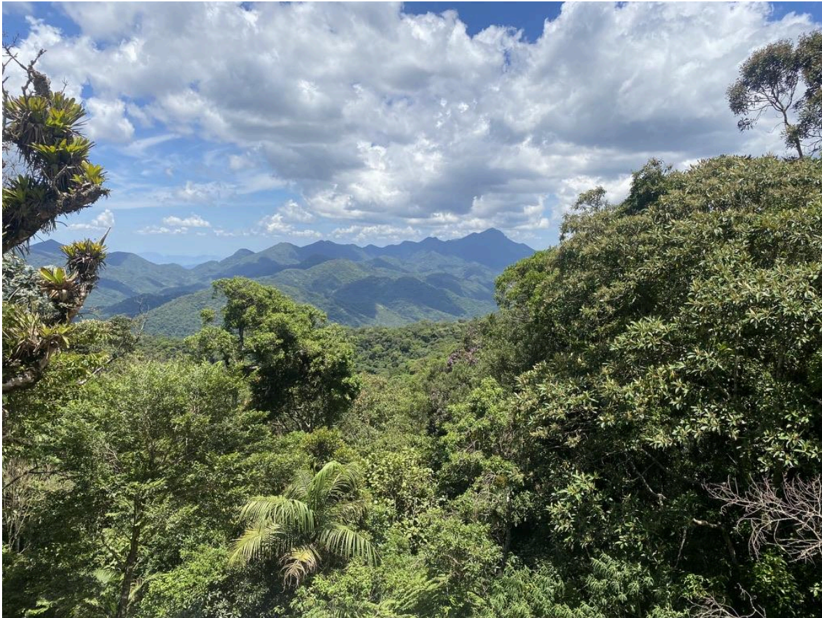
Atlantic Forest, Brazil. Februari 2025.