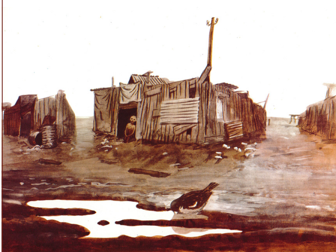
Image 4. Images of poverty and suffering in »The Fairy tale of Lotta from Dösjöbro«.

Max Lundgren associated social inequalities with the struggle for children's rights in different ways. In Omin Hambbe in Slättköping , he associates the privileged countries of Europe and the exploited countries of Africa with the relationship between adults and children. Here the juxtaposition of black people and children is not, however, to be understood as a colonial reflex to view non-European people as immature. Instead, it highlights the asymmetrical power relations between adults and children, by comparing them to the colonial attitude of whites towards non-whites. The young narrator opposes the way that black people are regarded as »underdeveloped« and thus questions the hierarchy between privileged and developing countries. At