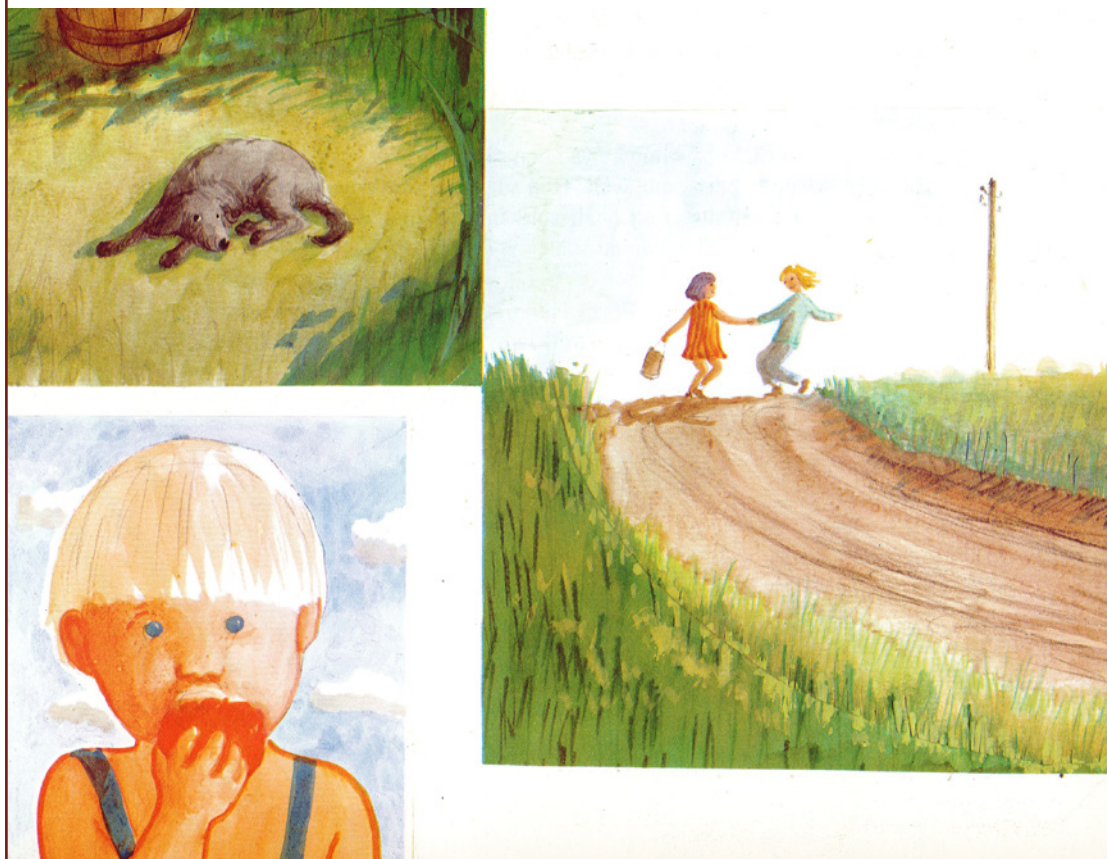
Image 5. Images of children and childhood in »The Fairy tale of Lotta from Dösjöbro«.

The story about Lotta, who leaves earth in order to tell God how »horribly unfair« it is to move the sun, emphasizes a rights discourse and the child as a rights-bearer. Which, for example, are the right or wrong actions, in relation to mother earth and the children who are going to inherit the earth? However, the religious motif of a God who wants to punish humans for their mischievous actions can be read on at least two levels. On the one hand, it is the manifestation of a higher order of justice issuing a harsh judgment upon earth and its inhabitants. On the other, removing the sun can be interpreted as the logical consequence of not taking care of the world. In Hald's pictures, the pollution and the dust of war simply make the sun disappear, leaving an image of a dark and gloomy world (Pictures 3 & 4). At the same time, the religious motif encapsulates what can be regarded as a childlike way of encountering unfairness: turning to the concept of God as the highest instance of justice. But it also signals that the child has at her disposal what can be considered a romantic connection to true righteousness, something that seems to be lacking in the adult world.