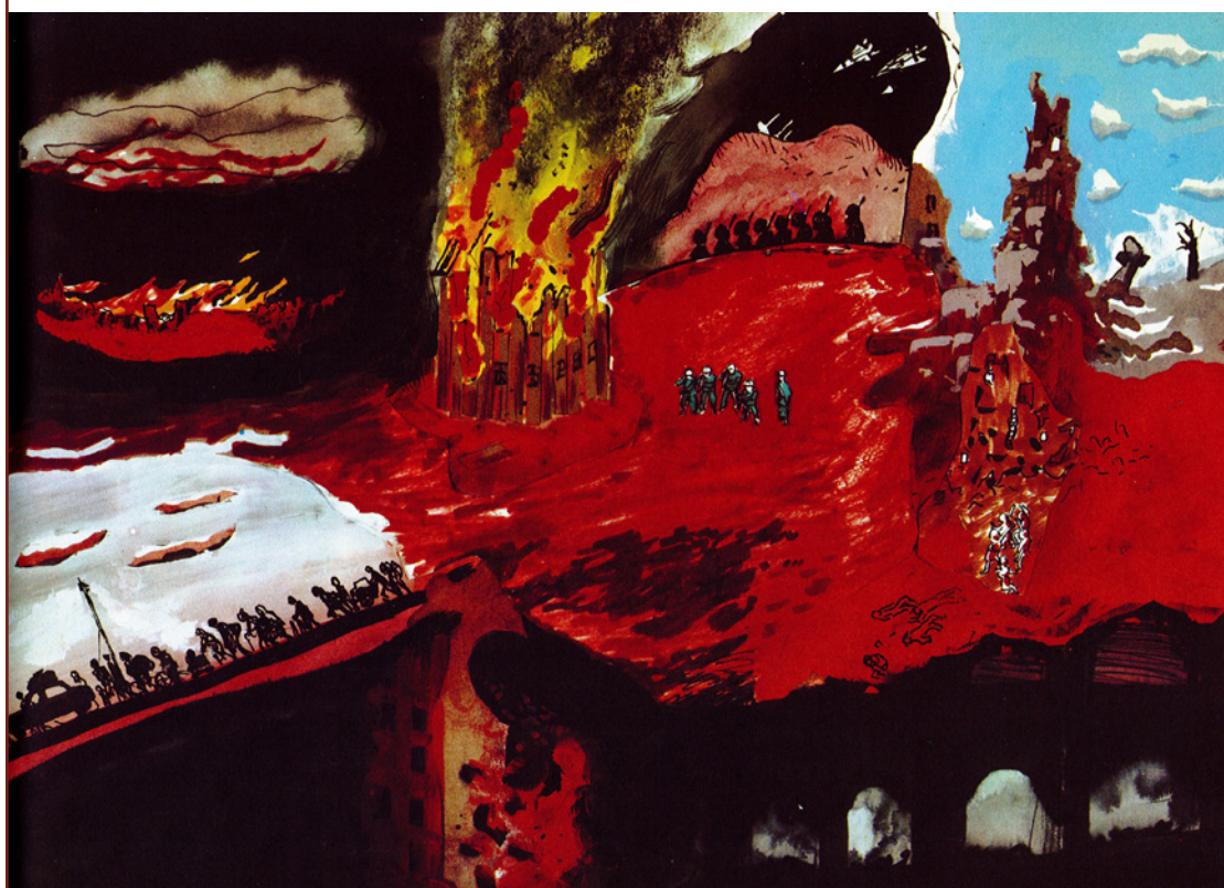
Image 3. Images of immigration, war and death in »The Fairy tale of Lotta from Dösjöbro«.