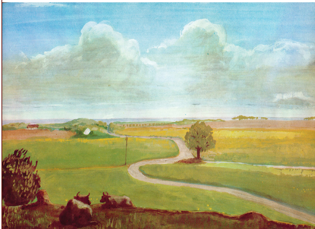
Image 6. The sun is shining over the world in »The Fairy tale of Lotta from Dösjöbro«.