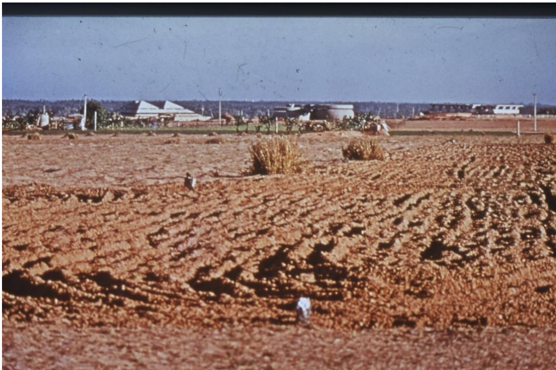
Among the first building in Auroville were the schools, which reflects the importance of education in Auroville.

seen that, when educational change has been so linked to cultural and political shifts, different forms of resistance have emerged over time. These have come to from different concerns and are characterized by different types of behaviour. The reason for this is often that the vision is not shared, communicated properly or partnered in process (Hynds, 2010). So how do teachers whose aim is to transform education – as in the example of Auroville which is a “living laboratory”– move beyond the fear of change? What lies between the dream of changing education and through that changing the world, and the insecurities we face in ourselves, parents and in society? It is this gap of practical implementation that I want to study. The reality of those working every day with real children and parents in a society created for transformation of humanity. What are the strengths, best practices, and challenges? What is needed from educators and parents to support this transformation? As a place that is being prepared for this kind of educational research, Auroville has been given a theoretical/philosophical guideline from where to begin developing a new education, called Integral Education. Sri Aurobindo saw this new universal education transform humankind, by merging eastern and western thought, and moving away from mainstream methods of teaching a pre-decided content, to developing individual and collective consciousness (Berggreen-Clausen, 2020).