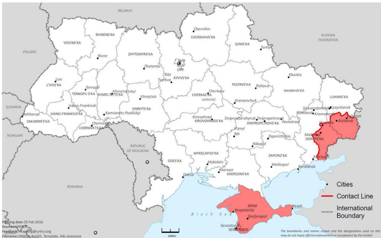
Fig. 2 Map of Occupied Territories

Protection of HRDs is different regarding the occupied territories and Russian legislatures as opposed to as against the Ukrainian Parliament. The Autonomous Republic of Crimea and the city of Sevastopol have seen a significant deterioration of human rights after the occupation by the Russian Federation in February-March 2014, evidenced by numerous reports of international agencies and human rights organizations (UHHRU, 2019).