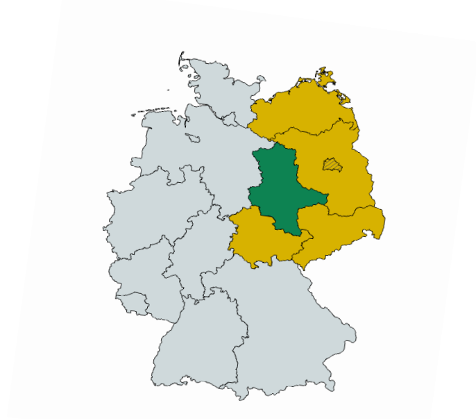
Figure 1: Map of Germany, indicating the location of Saxony-Anhalt (green) within the territory of the former GDR (yellow)

for the future, ranking at place 398 out of 401 districts. 7 Further, approval rates for the AfD are well above average ranging around 25%, making it the second-strongest party after the Christian Democrats CDU. The region's particular context shaped by the transformation period and the strength of the AfD makes Mansfeld-Südharz an interesting case for the exploration of political dissatisfaction.