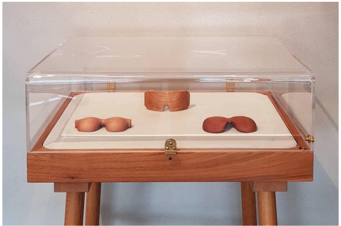
"See no evil" Triptych by Tobias Birgersson

an art exhibition forming a unique testament to these strange times we are all going through.