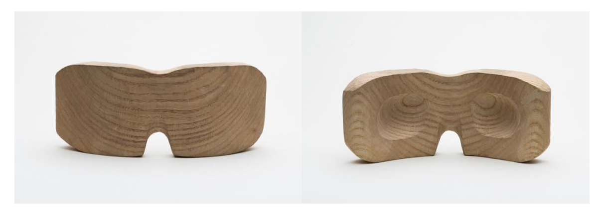
Ashwood Googles by Tobias Birgersson