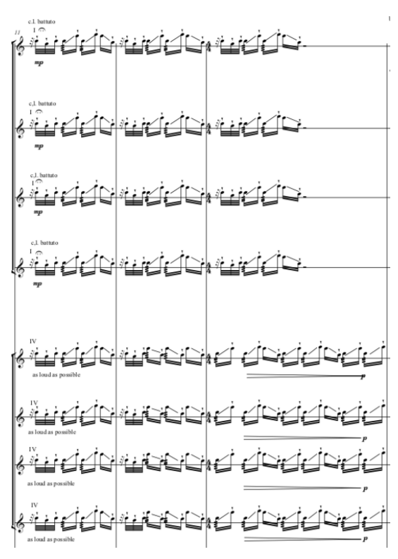
Ex 1. Representation of noise in part 1 of the piece, "Childhood" Merve Erez Playground of Yesterday (2019)