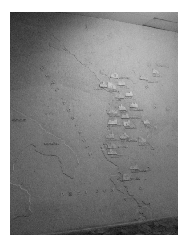
FIGURE 6. 2012: Ground floor of the Muzeu Historik Kombetar, Map of Illyrian settlements in the entrance of the exhibition room 'Antiquity of the Albanian people'.