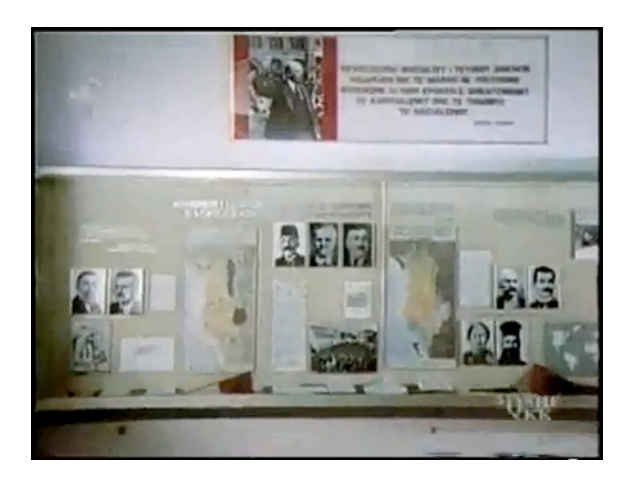
FIGURE 10. 1982: The Independence room: On the top, a display with a picture of the Soviet leader 'Lenin' and a quote from him, subsequently removed from the exhibition. (Muzeut Historik Kombetar, 1982, min. 18.15).

On the first floor of the museum, the room of the Albanian Independence depicts a political representation of this event through the eyes of the Communist regime and its subsequent transformation after the fall of that regime. In fact, the room has experienced some changes, such as the exclusion of evident Marxist-Leninist references (FIGURE 10). However, the space still conserves the same displays from the initial project.