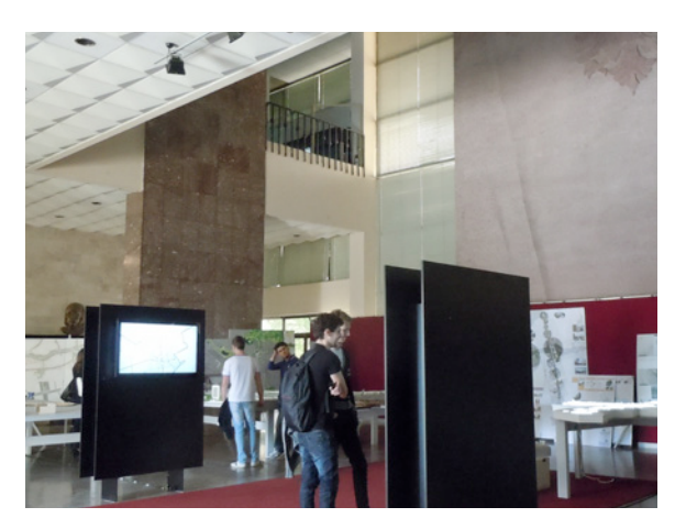
FIGURE 8. 2012: Main hall of the Muzeu Historik Kombetar. (Personal photograph).

FIGURE 7. 1982: Main hall of the Muzeu Historik Kombetar, on the right, the statue of Enver Hoxha. (Muzeut Historik Kombetar, 1982, min. 27.49).