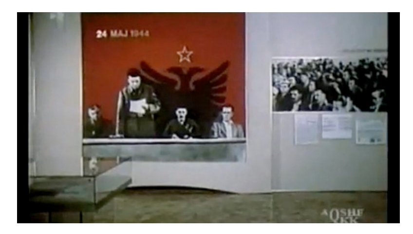
FIGURE 18. 1982: First floor of the Muzeu Historik Kombetar, Exhibition 'Antifascist National Liberation War like a great popular revolution under the leadership of the Comunist Party of Albania'. (Muzeut Historik Kombetar, 1982, min. 20.02).

The forgetting institution. Memory and oblivion in the National History Museum in contemporary Albania | Julián Roa Triana | 2012 | University of Gothenburg |