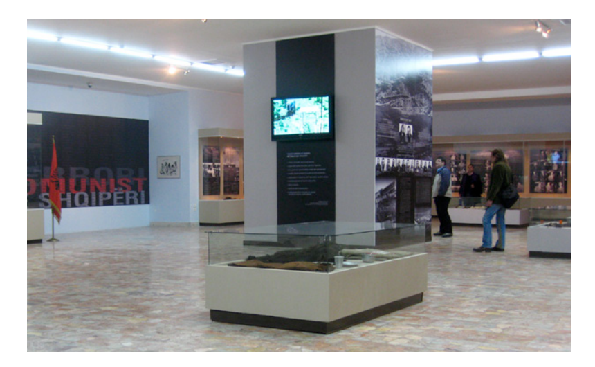
FIGURE 19. 2012: First floor of the Muzeu Historik Kombetar, Exhibition 'Communist Terror in Albania'. (Personal photograph).

FIGURE 18. 1982: First floor of the Muzeu Historik Kombetar, Exhibition 'Antifascist National Liberation War like a great popular revolution under the leadership of the Comunist Party of Albania'. (Muzeut Historik Kombetar, 1982, min. 20.02).