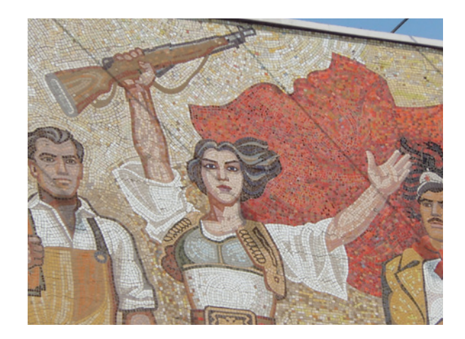
FIGURE 15. 2012: Front façade of the Muzeu Historik Kombetar, Mosaic The Albanians (detail). (Personal photograph).

FIGURE 14. 1982: Front façade of the Muzeu Historik Kombetar, Mosaic The Albanians (detail). (Muzeut Historik Kombetar, 1982, min. 01.30).