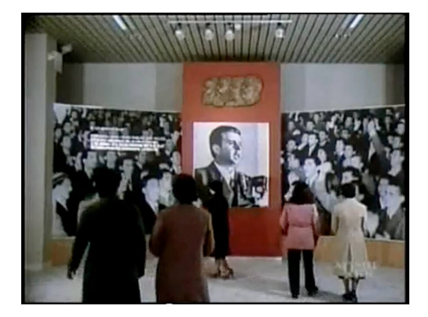
FIGURE 17. 1982: Second floor of the Muzeu Historik Kombetar, Exhibition 'Achievements of Socialism'. In the center of the image, a picture of Enver Hoxha. (Muzeut Historik Kombetar, 1982, min. 23.30).

The forgetting institution. Memory and oblivion in the National History Museum in contemporary Albania | Julián Roa Triana | 2012 | University of Gothenburg |