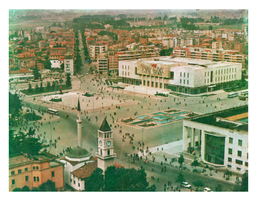
FIGURE 5. Ca. 1990: Panoramic view of Scanderbeg square and the Muzeu Historik Kombëtar in Tirana. The museum volume denotes a disproportion in relationship with other urban elements of the square and the city. Picture from the cover of the book Tirana (Gegprifti et al., eds., 1990).

them into 'masses' without political initiative. In that regard, it is possible to find several examples of places of the 'massification' of human beings: the Reichsparteitagsgelände (Party Congress Grounds) of the Nazi party and its extensive space for the 'perfect' marching coordination of the Wehrmacht (Armed forces of Germany from 1935 until 1945); or the construction of Arengarios <sup>17</sup> during the Fascist rule in Italy. These are architectural volumes directly related to the need for a space aimed to 'unify' the political discourse during the Fascist rule, in a way that its head 'Il Duce', Benito Mussolini, is highly visible up to the point that he is almost deified. Or finally, the characteristics of the Stalinist Brutalism style in Governmental Buildings (including museums and cultural centers) that sought to impose a 'crushing' concept on individuals by making the disproportion of the spaces in relationship with the size of other urban structures evident. That would symbolically express the unity of the Party and its members (FIGURE 5).