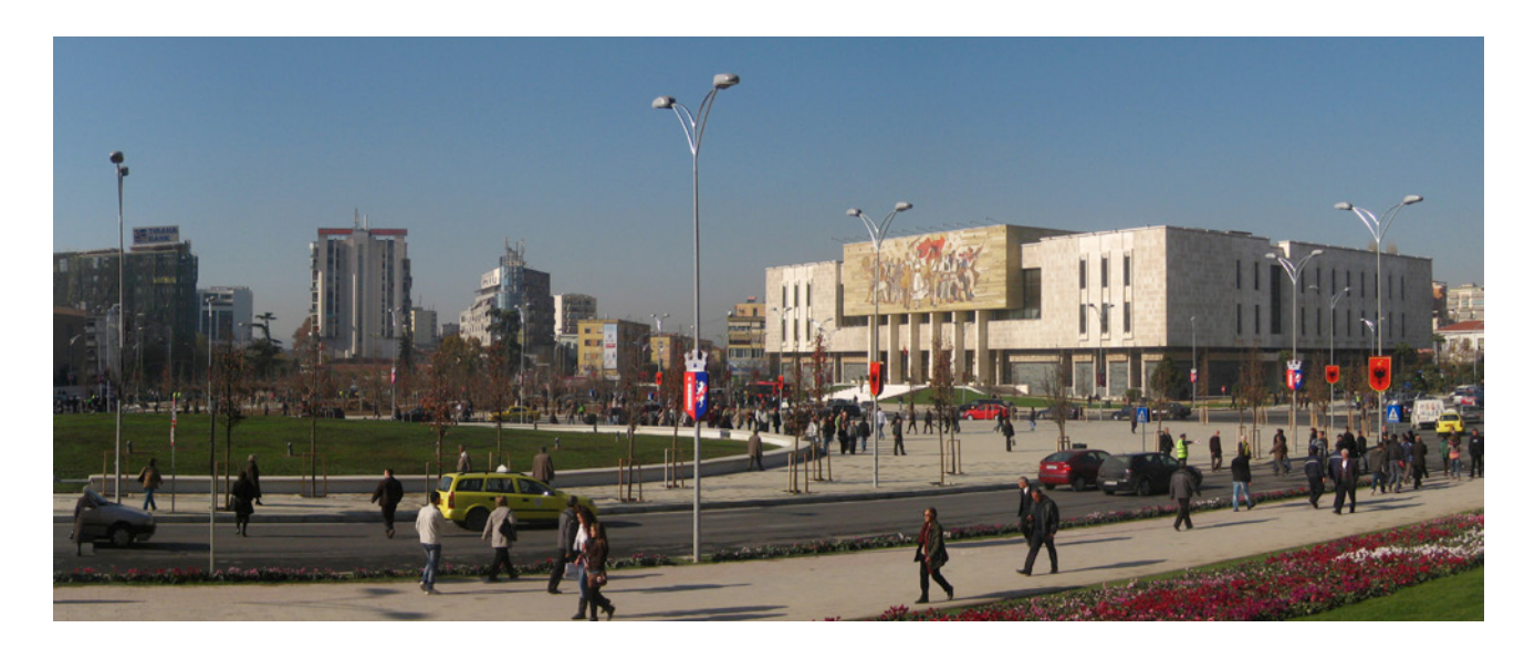
FIGURE 1. 2011: The National History Museum and Scanderbeg Square, Tirana, Albania. (Personal photograph).