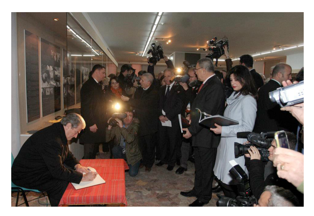
FIGURE 20. First floor of the Muzeu Historik Kombetar: exhibition 'Communist Terror in Albania', The incumbent Prime Minister Sali Berisha is 'registered' by the Albanian media while he leaves a note in the visitor's book of the museum (February 2012). (Në inaugurimin, 2012).

becomes a tool to establish a political ideology in contraposition with the Communist period. An action of political power based on historic memory and its core: memory and oblivion. That is the possible reason why the MHK, despite the fact that is not up to pace with the 'latest' museological tendencies or impressive amounts of visitors, is a place that the political establishment understands as politically relevant: the Prime Minister Sali Berisha and his entourage come to pay a visit to the exhibitions and society is informed about that through the evening news of most of the Albanian tv channels and newspapers (FIGURE 20).