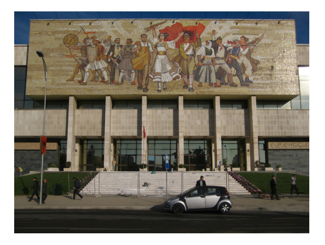
FIGURE 13. 2011: Front façade of the National History Museum and the mosaic The Albanians (1981).