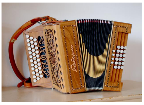
Fig. 1 My melodeon