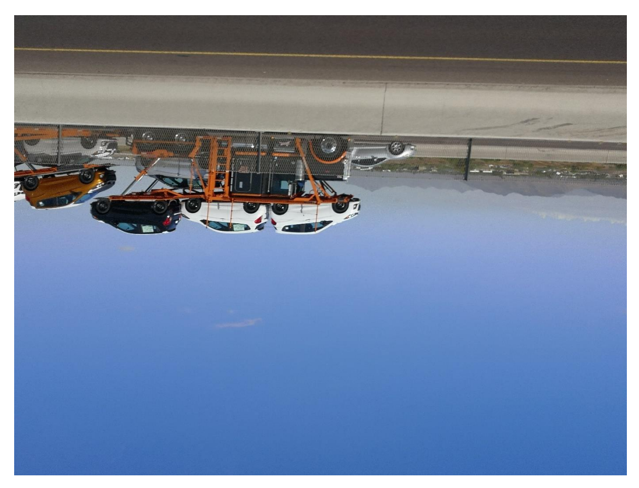
Upside down image, part of slideshow for webpage, Fredric Gunve