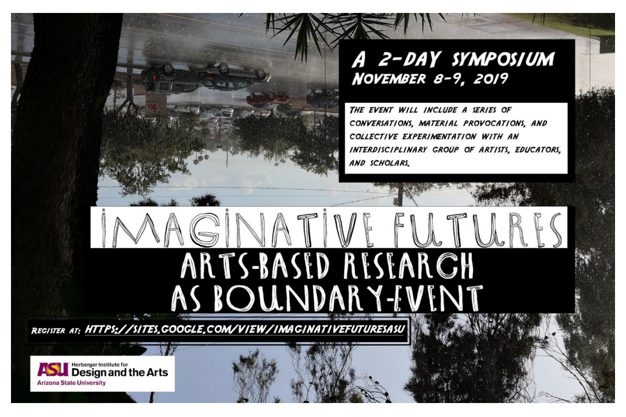
Symposium poster, design Fredric Gunve