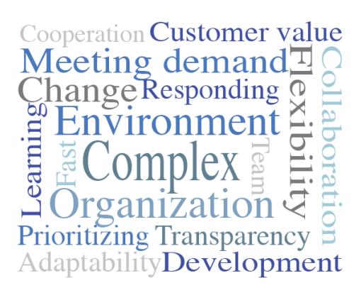
Figure 1. An illustration of terms used to describe the agile mindset.

All respondents were asked how they would define the agile mindset, a term which they often brought up in the interviews. Below is a summary of eleven principles they emphasized. They are summarized in a picture to make it easier for the reader to understand how respondent defines the agile mindset. The size of the words represents how often the word was mentioned in the interviews. The bigger a word is – the more used it was. As presented, 'complex' and 'organization' were most used.