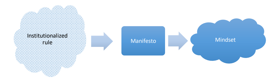
Figure 3. Previous illustration but with and alternative interpretation

Above is the illustration from the beginning of the analysis, but in a different order. The data outlined several management strategies which are similar to the agile approach and points out it is not hard to find a strategy with fundamental principles similar to the agile manifesto. Agile could be seen as part of a new era of strategies created to meet the demand of today's society and the individuals in it.