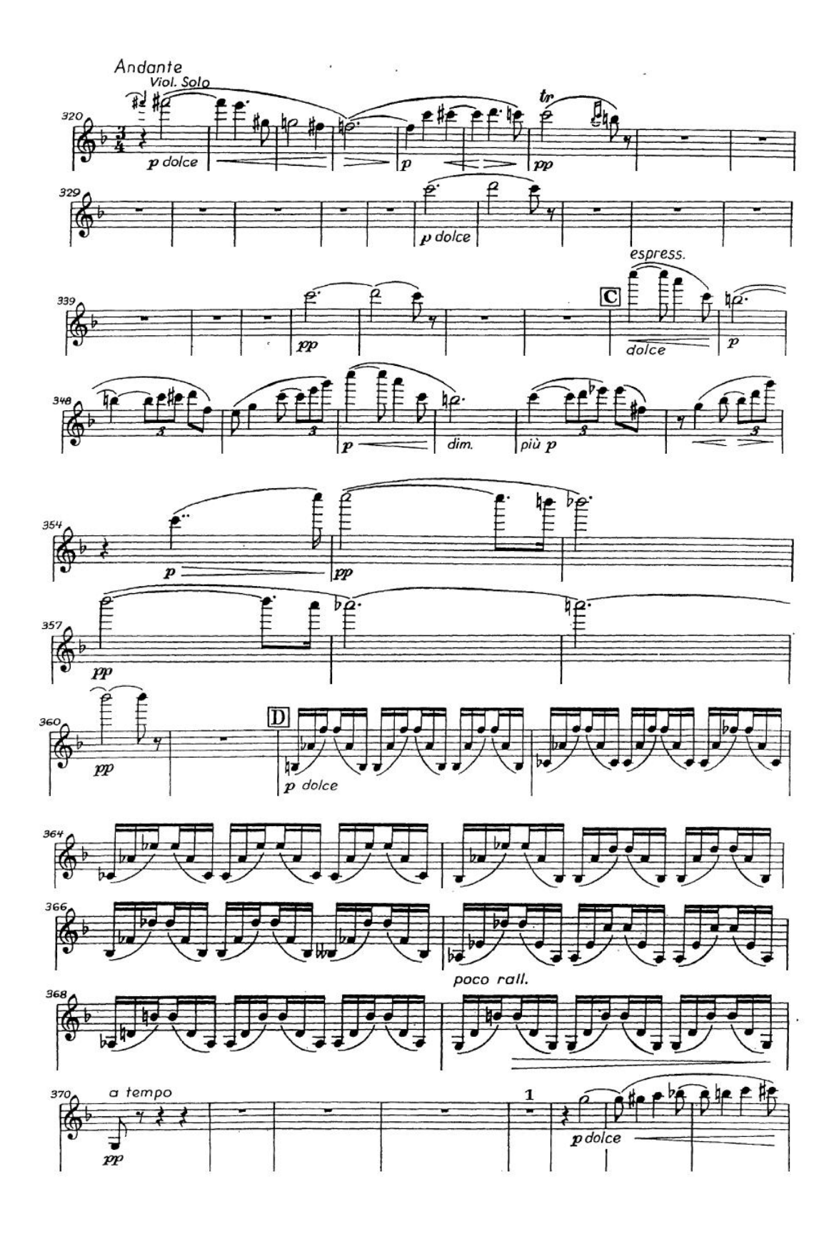
Figure 9 "Tannhäuser" Act One Scene Two<sup>19</sup>