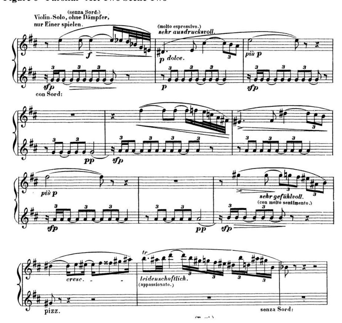
Figure 6 "Parsifal" Act Two Scene Two14

This relationship between the solo violin and seduction or supplication, it is in the next example, that appears in "Parsifal", shown in a worst light as it is associated with the accursed Kundry.