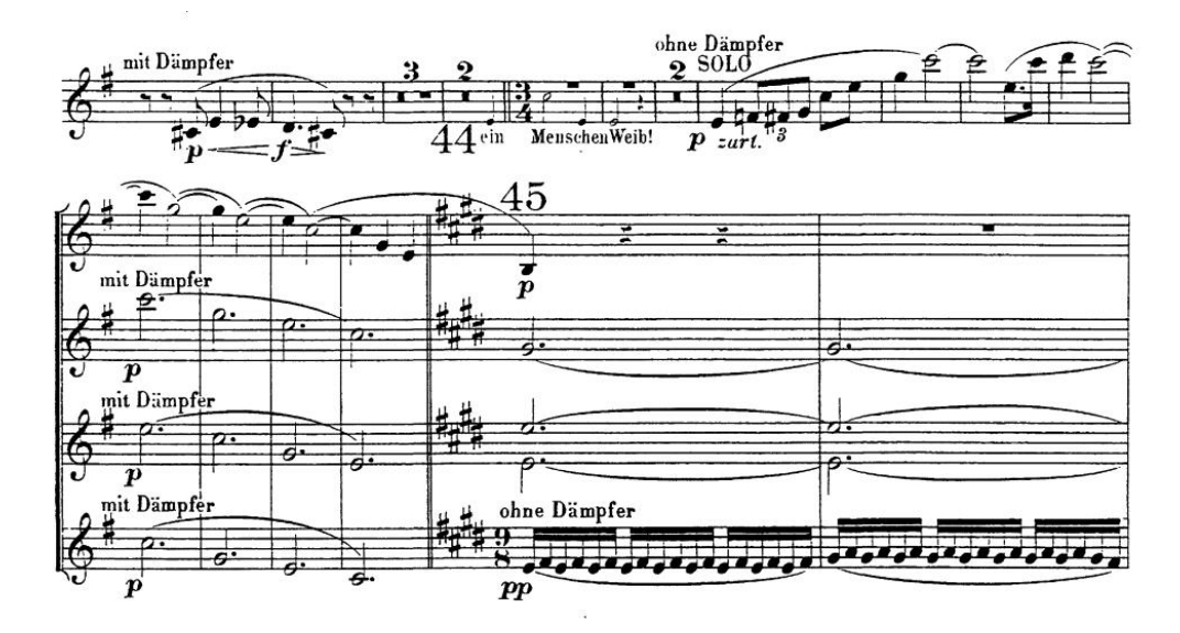
Figure 11 "Siegfried" Act Two Scene Two<sup>22</sup>

In the next example we'll see the violin solo in a more positive light, as we can't find any trace of deception, mockery or lustful feelings associated with it.