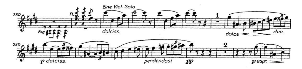
Example 8 "Tannhäuser" Act One Scene One<sup>17</sup>

Choir of sirens: "Near ye the strand! Near ye the land, where white arms pressing, love glowing, thronging, softly caressing still all longing" 18