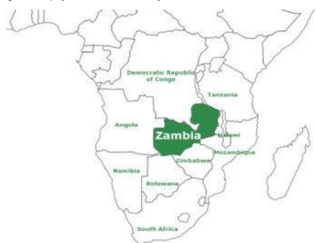
Figure 2: Map of Zambia and Southern Africa

In the past 20 years, discussions about overlapping memberships have come and gone. As mentioned in the introduction, the 2000s was an especially eventful decade with both CUs and EPA negotiations pushing countries like Zambia to assess its overlapping memberships (e.g., Kasanga, 2007; ECA, 2007). Tellingly, neither the CUs nor the EPAs materialized. COMESA launched a CU in 2009 but it is yet to be operationalized, much thanks to overlapping memberships (COMESA, 2013). SADC's plans to establish a CU by 2010 have been put on ice, also citing the issue of overlapping memberships. The EPAs are commonly cited as disastrous (Khadiagala, 2012). Overlapping regionalism remains salient.