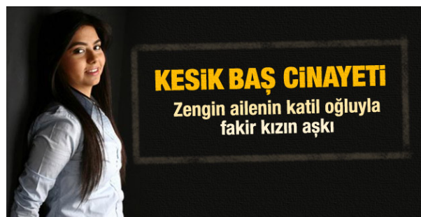
Image II. Example of romanticizing femicide case by media (Murder of the beheaded: Love between the Poor Girl and the Murderer Son of a Rich Family)

However, it was very interesting to compare femicide with hate killings. Before the term of femicide became widespread in the Turkish context, the discourse of "love killing" was commonly used by the press. Thus, femicide cases were presented to Turkish society as a love story ending with a killing. But "love" is a legitimation for a femicide case, and I argue that the discourse of "love killing" justifies and romanticizes the concept of femicide as shown in the news below (En Son Haber, 2014):