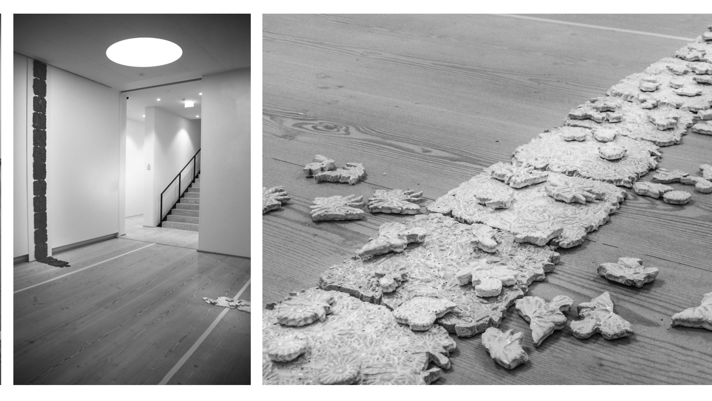
The installation was placed in both the sculpture park at the museum and in the underground exhibition hall in visual architectural dialogue with the architecture of CLAY Ceramic Art Museum and its sculpture park?

Photos at the former page; 3D scan of selected pots at CLAY Museum of ceramic art Denmark, from 3D computer mesh transformation- and from the art deco entrance at the museum done in wood. The ceramic installation is placed in the exhibition hall below ground level, and in the sculpture parl - (red) corresponding to the architecture at the site. Photos Anja Bache, drawing ground plan CLAY Ceramic Art Museum - Denmark with red lines Anja Bache.