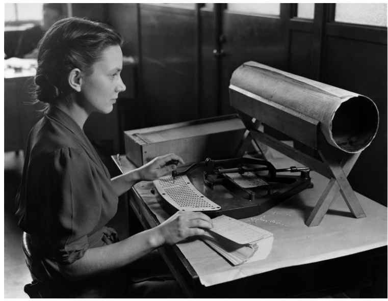
Figure 2: A worker producing punched cards.

[...] I guess the tasks became just what I expected in any case. (Laughter) Quite monotone, quite boring. Almost real punch-tasks. (Interviewee 5)