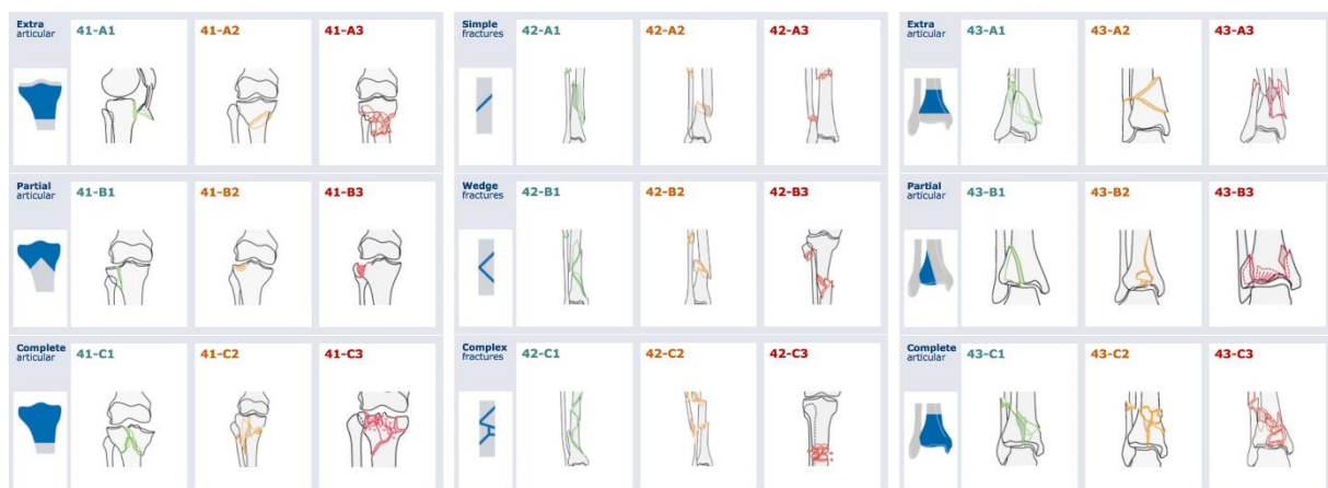
Figure 1 AO/OTA classification of tibial fractures in the Swedish Fracture Register

When studying the epidemiology of tibial fractures, classifying of the fractures is necessary. There are several systems of classification for tibial fractures according to location, morphology and soft tissue injury. The AO/OTA classification system (Figure 1) (4, 5) however is the most often used classification system (6). The Gustilo-Anderson classification (7, 8) is the most commonly used classification for open fractures. These two classification systems are also used in the SFR (9, 10). An ideal classification system should meet several criteria, such as being widely recognized, extensively employed, comprehensive, user friendly and valid but no current classification system meets all these criteria. However, the AO/OTA classification system is the most commonly used (9).