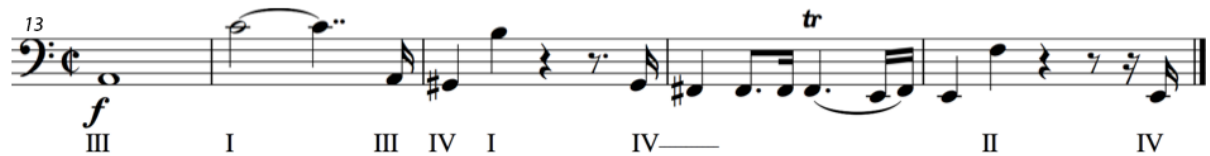
Music ex. 8. W.A. Mozart: symphony no. 35 (Transcribed edition)- 1 st movement from bar 13 to 17- bass part.

The scales from bar number 19 to 23, see music example no. 9, are developed in a vertical way on a modern double bass tuning. 47 To perform this scale the left hand is supposed to shift at least 3 times and the jump from the lowest F# to his upper octave could be challenging for the intonation.