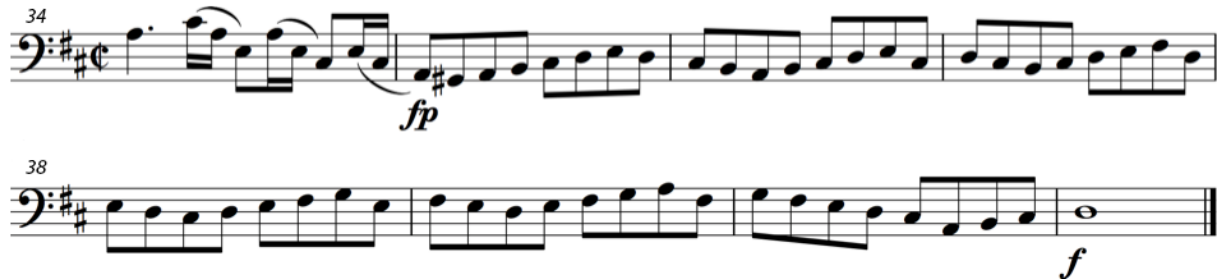
Music ex. 11. W.A. Mozart: Symphony no. 35- 1 st movement from bar 34 to 41- bass/ cello part.

Adopting the modern tuning, in the first bar there is the necessity to shift back from A to E on the same string keeping a fast legato effect and clarity in sound. 49 This problem is not present in a bass tuned in Viennese tuning; the entire bar can then be performed in a low position on the bass without any shift (see music example 12). 50