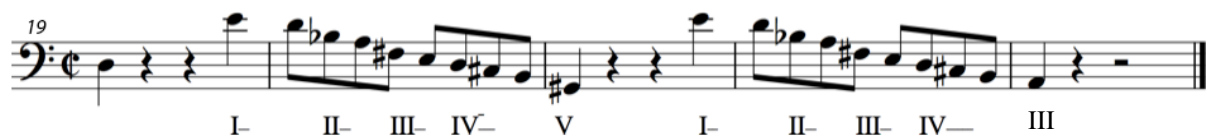
Music ex. 10. W.A. Mozart: Symphony no. 35(Transcribed edition)- 1 st movement from bar 19 to 23- bass part.

On the contrary thanks to the period tuning, the scales can be performed without any shift and in a horizontal way taking advantages of the presence of five strings or performing the last note on an open string generating a more ringing sound. 48