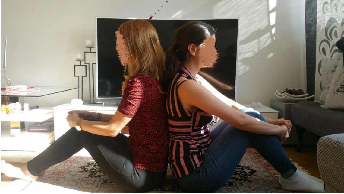
Figure 4.2 “Back By Back” sitting position to start talking and developing eye contact