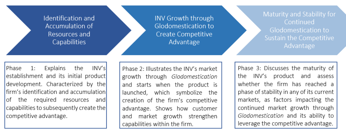
Figure 5: Framework of INVs' Internationalization Process and Creation of the Competitive Advantage

This chapter analyzes the most crucial empirical findings outlined in the previous chapter in relation to the theoretical framework chapter. The analysis will be presented through a framework of three specific phases, which have been identified based on the empirical findings and supported by related theoretical phases. Further, these phases will be compared from a cross-case perspective in order to discuss and present a context of the linkage between internationalization and the creation of a competitive advantage of Indian IT INVs'.