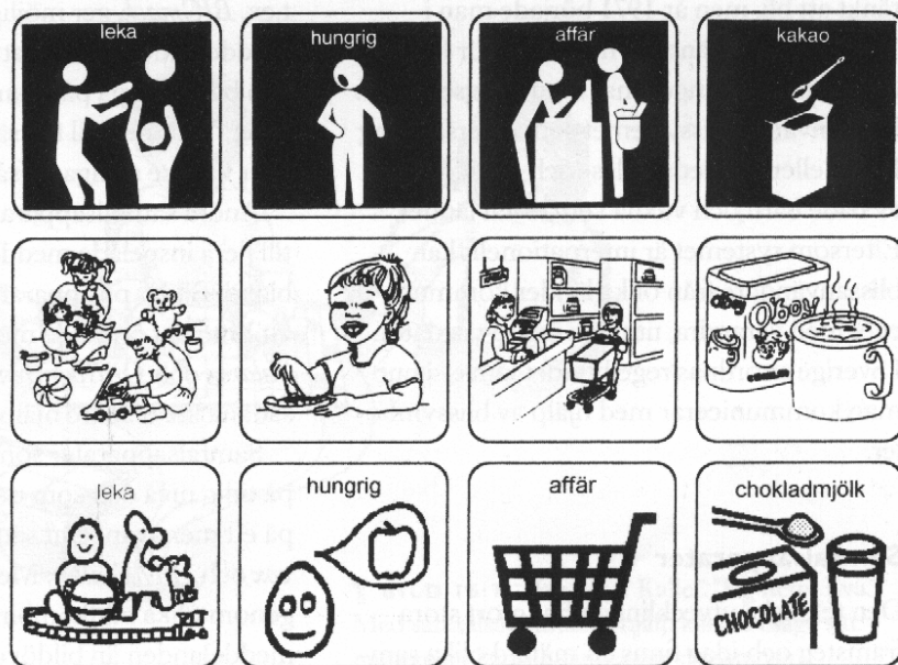
Figure 2. Examples of three different graphic communication systems (from the top): Pictogram, Nilpictures, and Picture Communication symbols (PCS). Adapted from Bergh & Bergsten (1999). Symbols depicted are (from the left): play, hungry, shop and chocolate drink.

In order to be able to communicate thoughts, emotions and ideas on a more complex level, however, a more advanced form of graphic AAC system is needed. One such system is the so-called "Blissymbolics" (Bliss) system. Bliss, created by Charles Bliss in the late 1940s, was originally intended as a communication system for international communication. Bliss never became the world-language that Charles Bliss had hoped for, but in 1971 the system was instead taken up by the Ontario Crippled Children's Centre (now known as the Bloorview-MacMillan Centre) in Canada and used as a communication aid for children with physical disabilities and speech production problems (McNaughton, 1998).