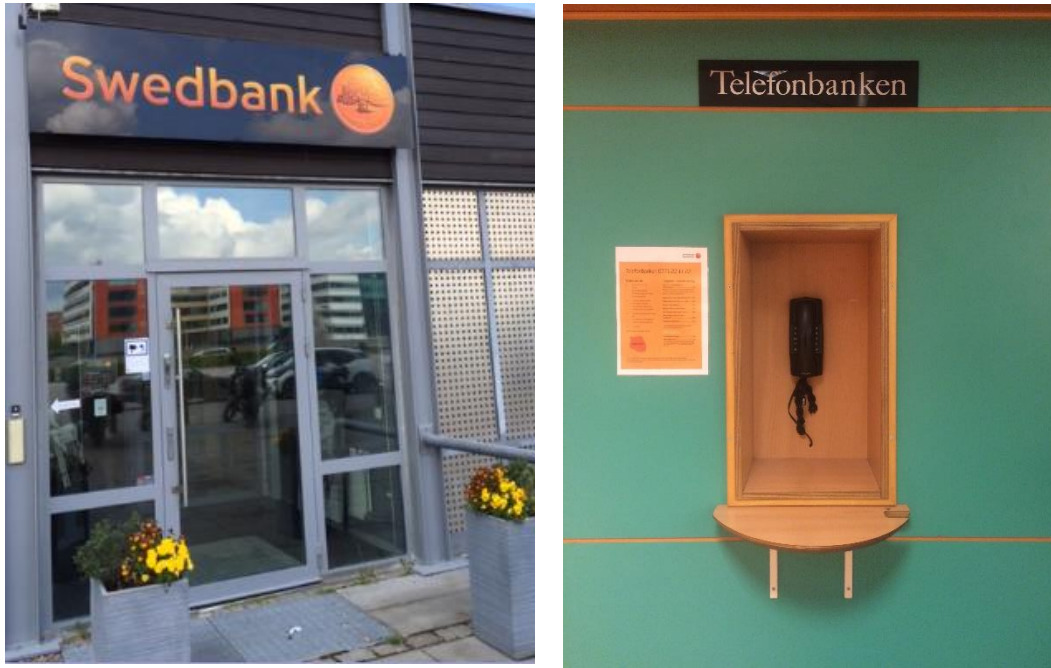
Picture 1. A Swedbank Banking Office in Gothenburg and Telephone Banking

Swedbank has been a part of the Swedish saving banking history since 1820 and its impact on the society today is for instance reflected in its role as an important player on the local markets. The values that Swedbank stands for are simple, open and caring. It strives for delivering easily understood services and advices as well as keeping its promises to its customers (Swedbank, 2013; Swedbank, 2015:a).