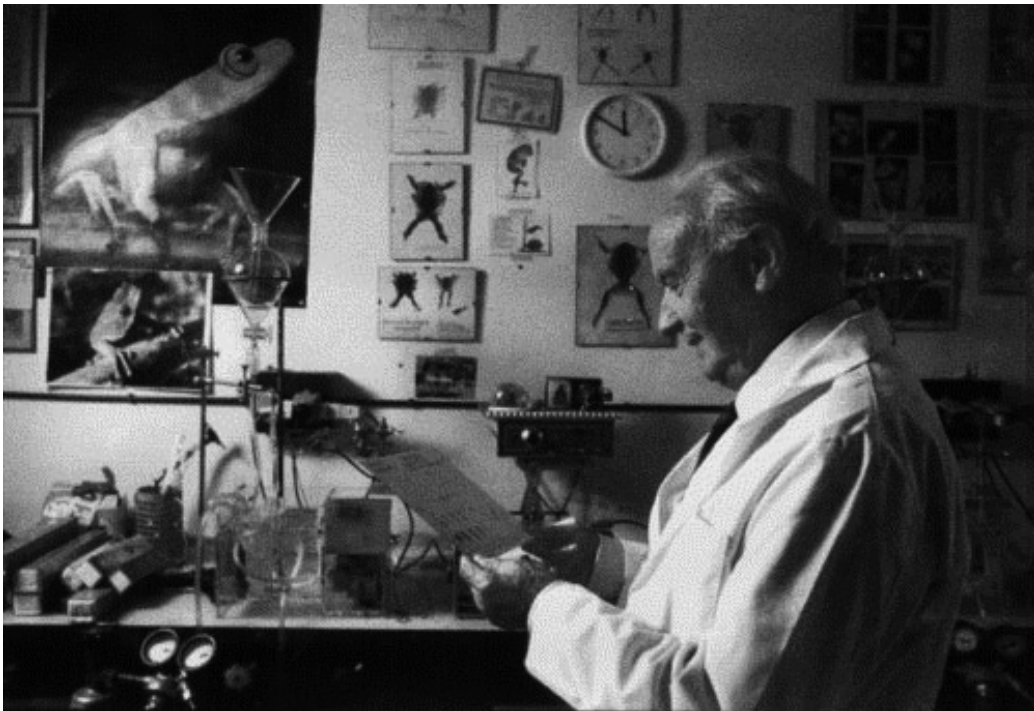
Figure 1: Vittorio Erspamer at work in his laboratory in Rome, circa 1990.

In 1948 a group of American biochemists working at the Cleveland Clinic discovered a substance that was present in blood and capable of inducing vasoconstriction 19 . It was subsequently named serotonin . Four years later serotonin and enteramine were shown to be the same substance 20 and a year later, in 1953, it was shown to be present in the brain 21 .