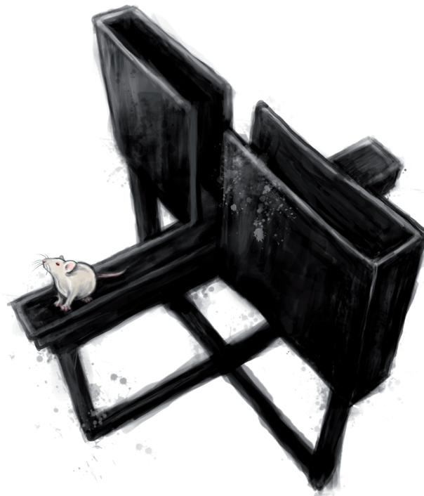
Figure 3: The elevated plus-maze.

Often, but not always, the stimulus is presented in the context of a choice in which something desirable (e.g. food or exploration of a new area) necessitates exposure to the aversive stimulus, creating a conflict. According to some authors, such conflicts might be similar to the ones allegedly underlying anxiety in humans, as once suggested by Sigmund Freud. Also for one not sharing the belief that psychiatric disorders are caused by unconscious conflict, it may however make sense to expose an animal for a choice, hence testing the willingness of the animal to expose itself for possible danger, as a measure of its proneness for fear or anxiety.