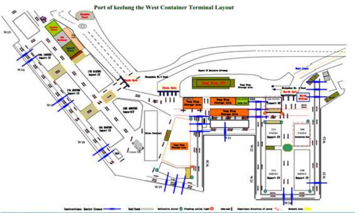
Diagram 1 (Port of Keelung, 2014)

The port of Keelung is our port of destination and is surrounded by mountains to its west, east and south, it is located on the Southeast tip of Taiwan. The waterway is approximately 2km in length and has a width of 0.4km. The port covers a total area of 627 hectares of which 20 hectares is reserved for the container yard area; these are subdivided into 22 container yards. There is a container station which covers 7.5 hectares and has a capacity of 8 700 tons. (Shipping Online, 2009). A further 17 hectares is dedicated for warehousing. The diagram below shows the container operations and how the gantry cranes are located in relation to the container yard. The blue lines are gantry cranes and the spaces behind them are container holding areas