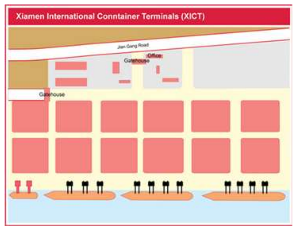
Diagram 4 (Hutchinson Port, 2014)

a total of 122 births and plays host to 53 international container shipping lines (World Ports source, 2014). The dry-dock size is considered to be medium in size while moderate ship repairs also happen at the port. Pilotage is compulsory and is handled by the numerous tug boats the port owns. The port has a total of 31 rubber tyre gantry cranes and an additional 11 container quay cranes. The port also has 2 general cargo quay cranes. On the movement of goods side, the port has a total of 9 front loaders as well as 15 forklifts.