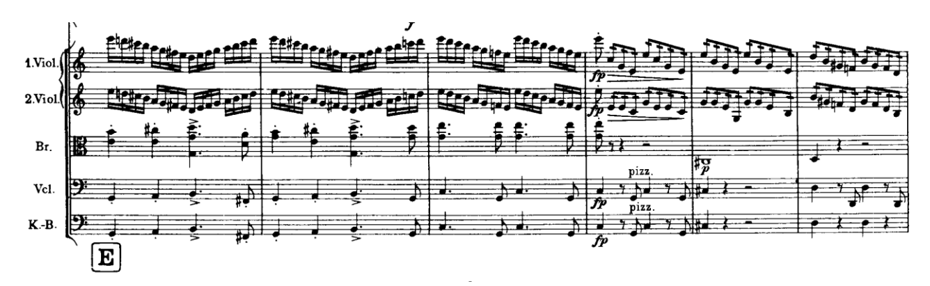
Example 1d. Brahms Symphony no 1, 4^{th} movement. The 1^{st} and 2^{nd} violins playing the same scale in different octaves

Classical music is often orchestrated in such a way that a melodic line is played by more than one section simultaneously, in the same or different octaves. This is very characteristic especially for the 1<sup>st</sup> and 2<sup>nd</sup> violins (example 1d). Instruments/sections playing the same theme should find support in each other in terms of intonation and articulation. Usually letting the lower octave be more dominant, the intonation becomes better.