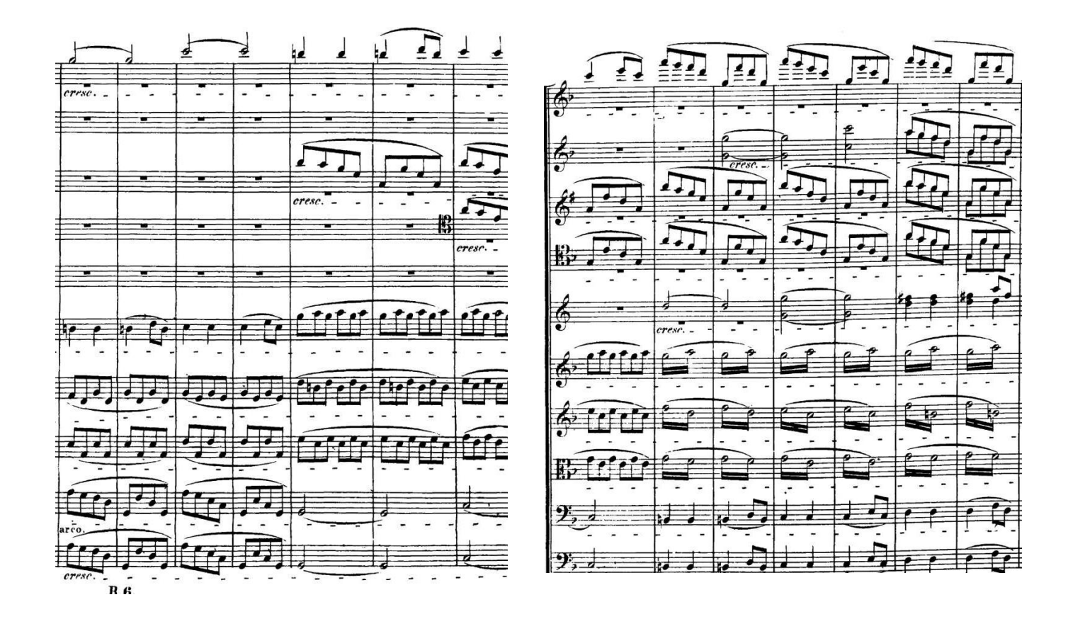
Example 1b. Beethoven symphony no 6 (Pastorale) 1<sup>st</sup> movement. Flute has a singing melody and the violins have accompaniment with changing rhythmical patterns. Instruments from above: flute, oboe, clarinet, bassoon, horn, 1<sup>st</sup> violins, 2<sup>nd</sup> violins, violas, celli and bass

The third very common situation is the rhythmical dialogue between two instruments/sections (example 1c). If one has trained ones ears to find the counterpart of the dialogue as fast as possible, it will make playing together much easier.