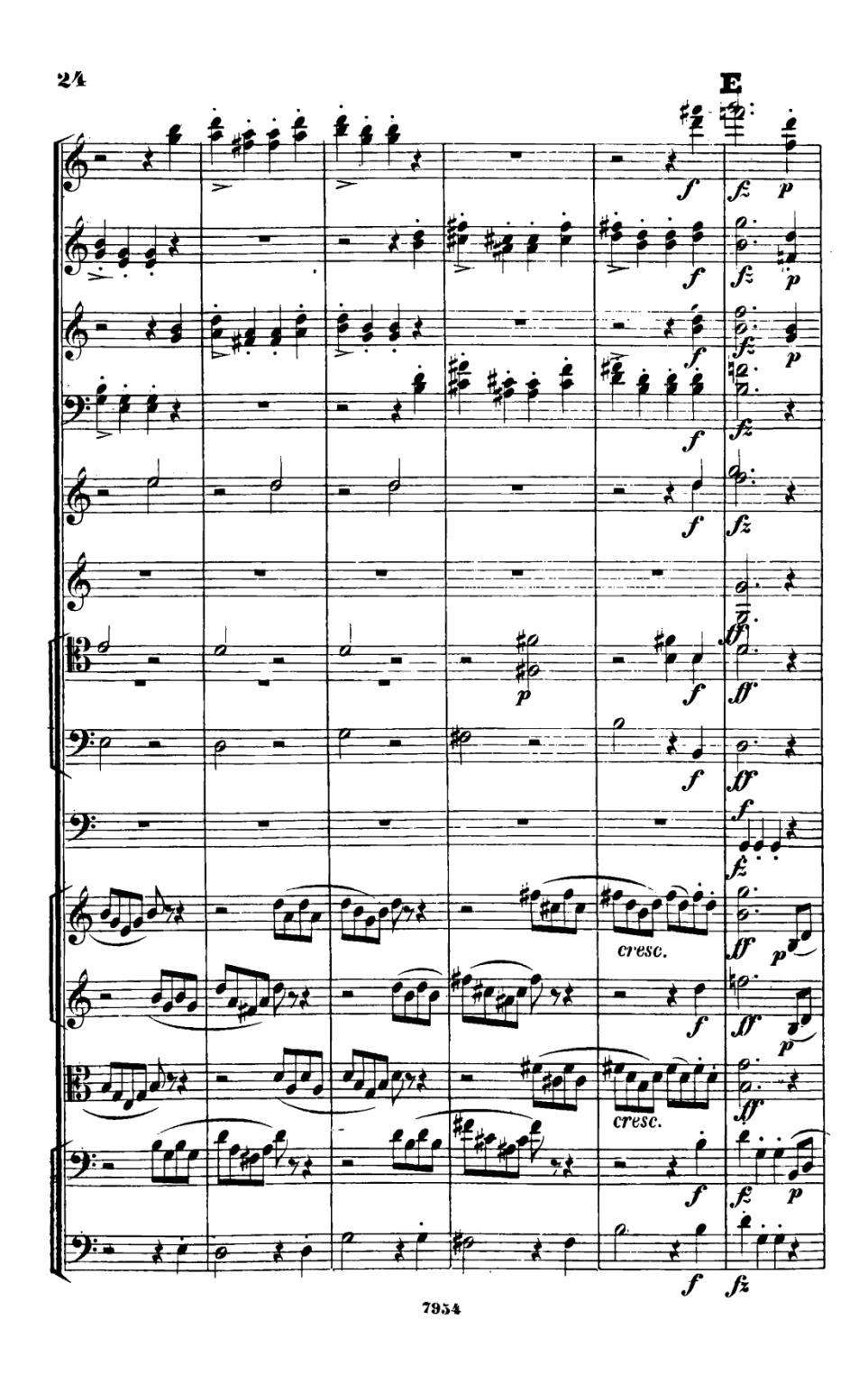
Example 1c. Schubert The Great C major symphony no 9 1^{st} movement. The dialogues can be found both in strings ( 1^{st} violins and violas in dialogue with 2^{nd} violins and celli) and winds (flutes and clarinets in dialogue with oboes and bassoons) Instruments from above: flute, oboe, clarinet, bassoon, horn, trumpet, trombone, bass trombone, timpani,1 st violin, 2^{nd} violins, viola, celli and bass