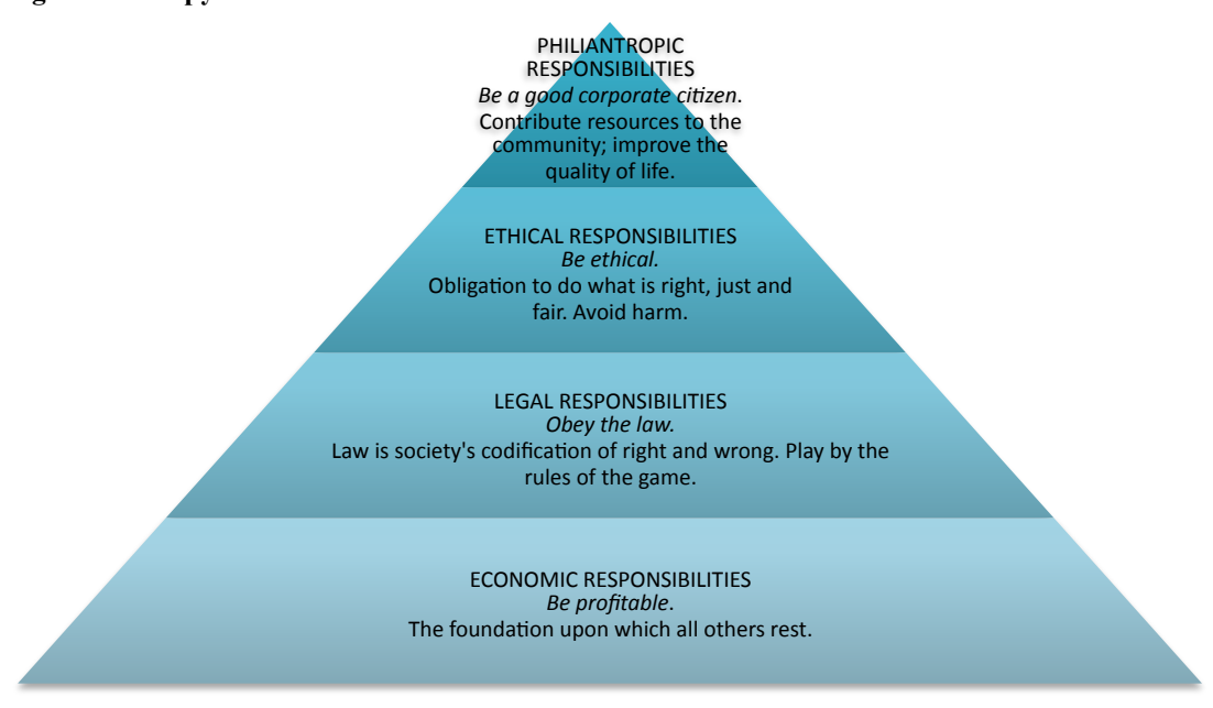
Figure 1: The pyramid of CSR

According to Freeman (2010:44ff) there is a clear link between stakeholders and legitimacy. He argues that it is necessary for the success and survival of a company that the