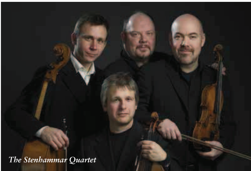
The Stenhammar Quartet