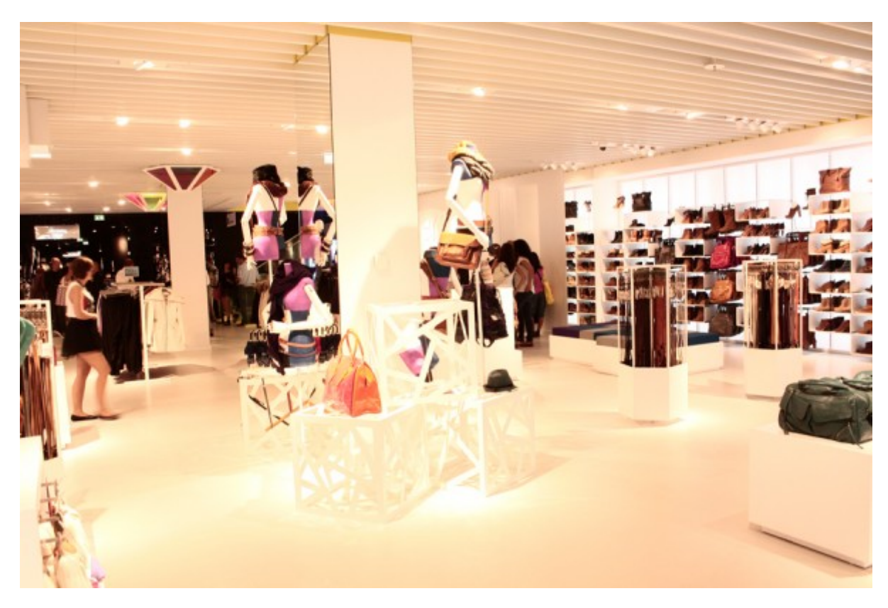
Photograph\ 3-Bershka\ store,\ Berlin,\ Germany.\