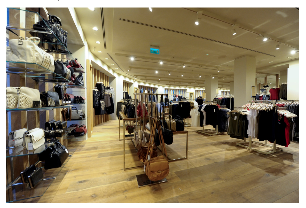
Photograph 4 - Mango store, Munich, Germany.