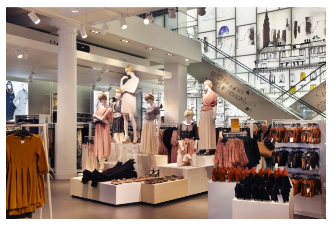
Photograph 1 - H&M Regent Street store, London, United Kingdom. [http://www.myretailmedia.com/blog/7193/h_m_sales_steady_despite_eurozone_woes.php]