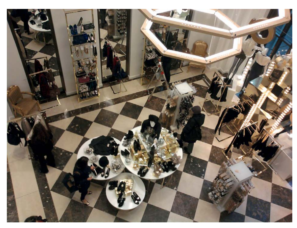
Photograph 5 - Forever 21 store, Fifth Avenue, New York, United States. [http://lilyisrandom.blogspot.se/2010/12/forever-21-on-5th-avenue.html]