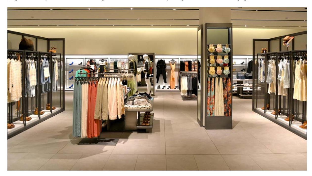
Photograph\ 2\ -\ Zara\ Chadstone\ Shopping\ Centre\ store,\ Chadstone\ (Melbourne),\ Australia.\ [http://hayleymehmet.blogspot.se/2012/08/zara-opens-chadstone-store.html]