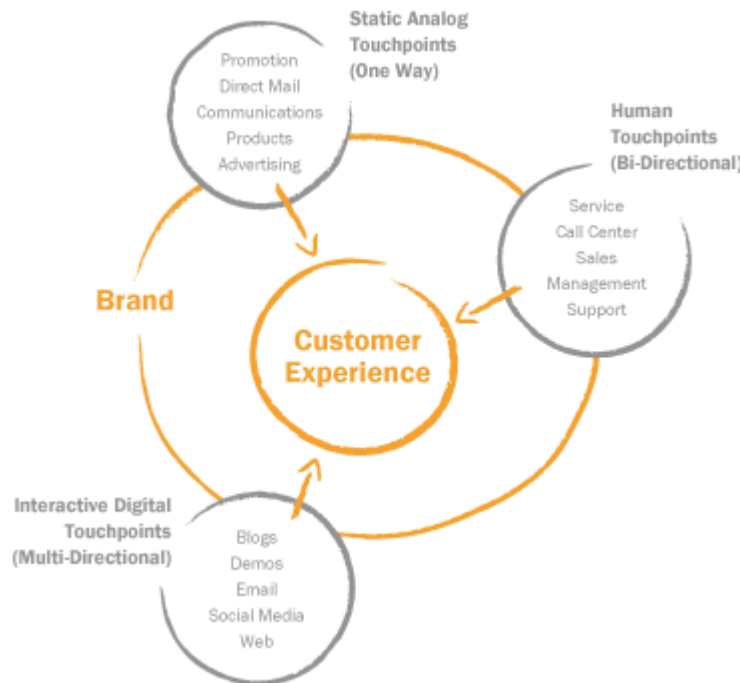
Figure 3 - Customer Touchpoints Affecting Customer Experience (MCorp Consulting, 2012)

Consulting, 2012). As stated in the introductory chapter; while customer touchpoints prior to the boom in IT advancements were traditionally bound to either human touchpoints (bi-directional) such as sales, support and call-centers, or static analog touchpoints (one way) such as promotions and advertising, interactive digital touchpoints (multi-directional) are now available at hand for companies interacting through various web tools and social media.