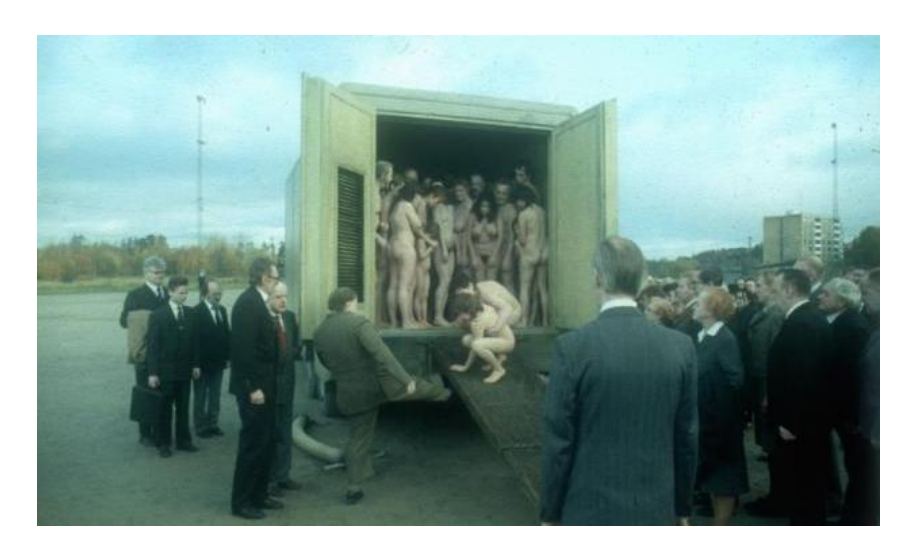
Figure 6 World of Glory, dir. Roy Andersson (film still)

soundproof system that would be made more efficient later on, but the principle was already there. The picture bellow is from the film World of Glory (Härlig är Jorden) by Swedish director Roy Andersson. The film starts with a scene that reconstitutes one of those first attempts at killing with a van during the Second World War. However, the scene is not connected to any specific time period.