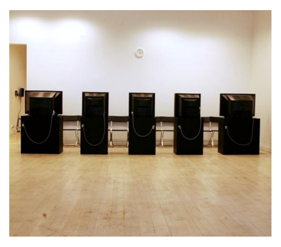
Figure 5 Interview, installation view.

In my project, the physical structure was important in the two parts of creation. First there were the interviews, and it was fundamental that the subject and I were in different rooms, with me being able to see without being seen, his room dirty with unpleasantly bare walls, the window covered. In the second part, the installation (Fig. 1 and 5), I decided to present the videos in a structure that used all the main elements encountered in fascist architecture: symmetry, austerity, straight lines, neo-classicism. Chairs against a wall and a clock over them completed the set with elements which are found in the interior decoration of many institutions, from schools to prisons. Moreover, the TV monitors facing the chairs from a short distance served as a way of turning the experience of watching into oppression. The people sitting on the chairs had to be in a position where they could be seen from the visitors in the middle of the room; and to be able to get In front of the TVs, they had to pass through the narrow spaces in between.