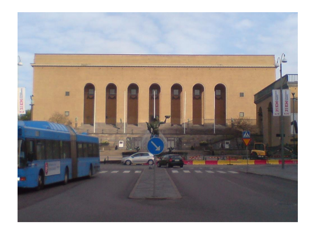
Figure 2 [Top left] Luitpold Hall, at one edge of the Luitpold Arena. Nuremberg, Germany.

Figure 3 [Top right] Dasangwan Hall, the former Main Hall of Keijo Imperial University School of Engineering in Seoul, South Korea.