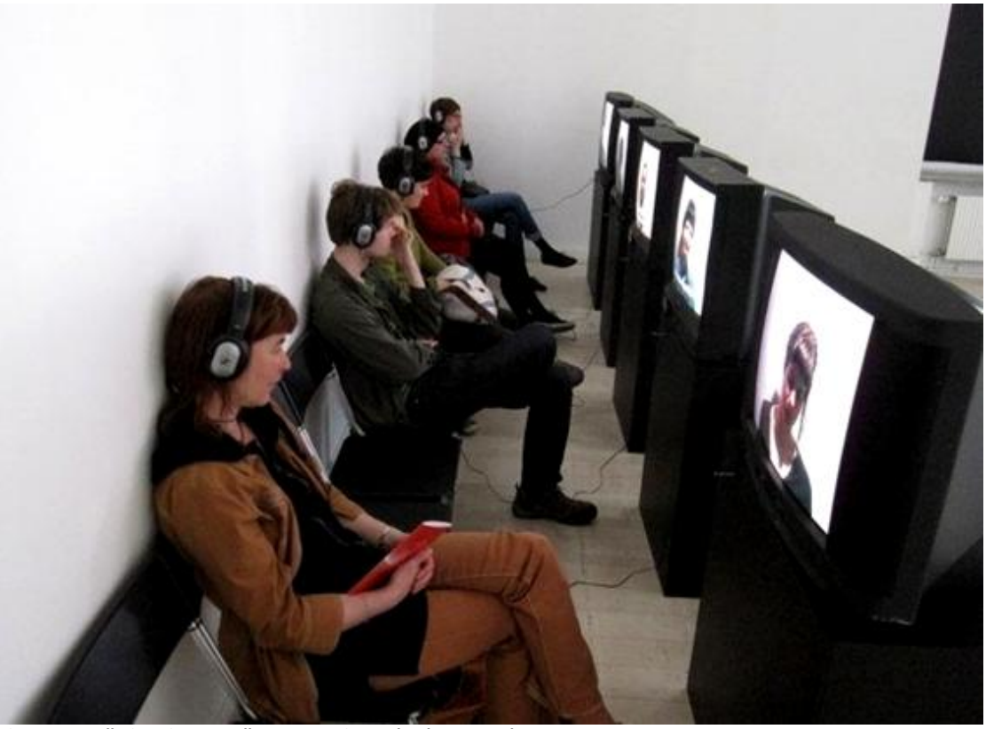
Figure 1 Installation view at Gallery Rotor 1 in Gothenburg, Sweden.

obvious when watching a few interviews, because there are few things that make sense. There is no point, there is no information that is really expected from any of the subjects and I – as an interrogator – often contradict myself. I see these contradictions as a satirization of bureaucrats who might be helpful or not according to their mood, but always justified by power structures.