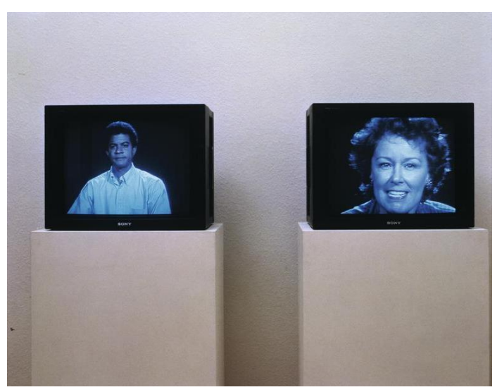
Figure 9 Bruce Nauman, Good Boy Bad Boy (1985), installation view.

In this work Bauman makes perfectly banal activities sound bizarre, which creates a distancing effect. I found that the use of language and repetition, associated with the set up were similar to some of my techniques.