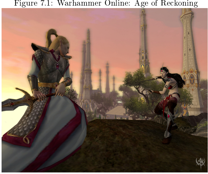
Figure 7.1: Warhammer Online: Age of Reckoning

Warhammer Online: Age of Reckoning (WAR) is an MMO developed by Mythic Entertainment who are most reckoned as the developer of the well known MMO Dark Age of Camelot.